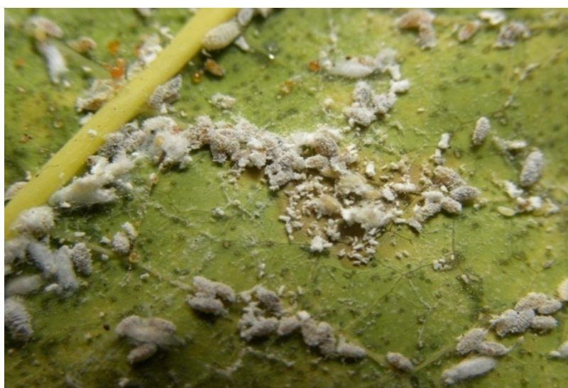
Plate 2: Parasitized mealybugs on papaya leaves Table 2: Parasitisation rate of Acerophagus papayae

the findings of Amarasekare et al 1 , who reported that the mean per cent parasitism of A. papayae was 82.8 \pm 21 . Similarly, Noyes and Schauff 8 who reported that the A. papayae complete their life cycle in the second instar of mealybugs and produced a higher proportion of female progeny because, second instar mealybugs may have enough resources for the smallest parasitoid A. papayae . Amarasekare et al 2 , also reported that the maximum parasitisation was observed in stem and twigs as compared to other parts of plant.