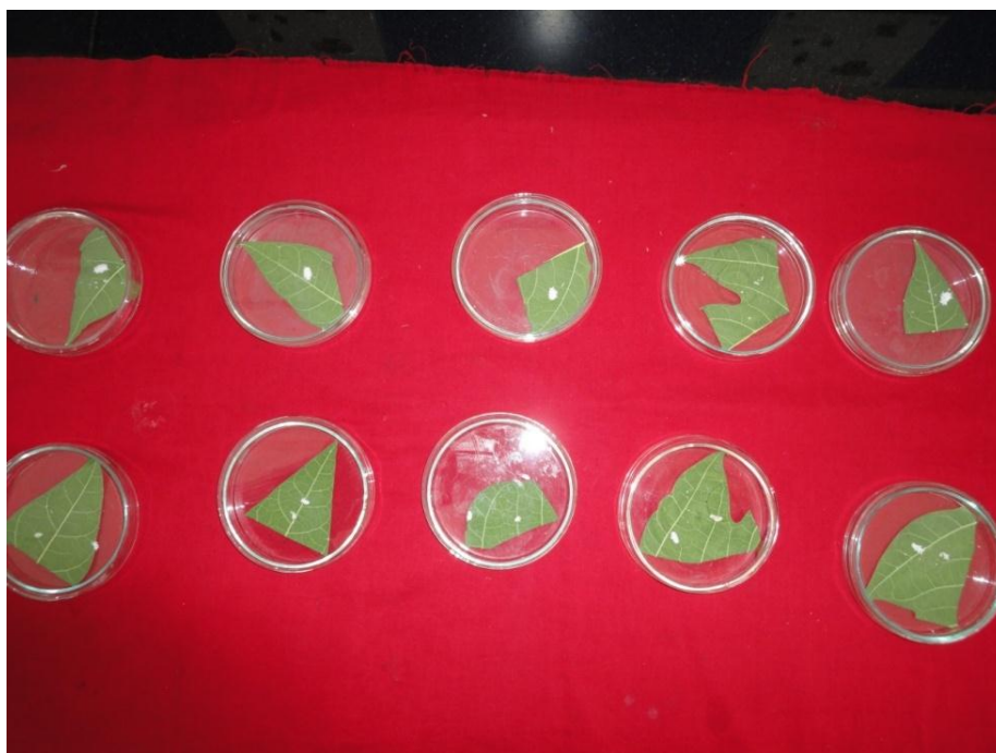
Plate 1: Feeding potential of Ladybird beetle, Cryptolaemus montrouzieri on adult females on papaya mealybug, Paracoccus marginatus

Experiment was conducted to determine the rate of consumption of mealybugs (adults) by the predatory grub. The lady bird beetle, Cryptolaemus montrouzieri culture was obtained from NBAIL, Bangalore. After hatching, each predatory grub of first instar confined in a petriplate and provided with the known number of female mealybugs (Plate 1). Observations were recorded on number of mealybugs consumed during every 24 hr interval. Surviving preys were counted and removed. Fresh preys were offered to predatory grubs every day until its pupation. Number of preys consumed by the predatory grub in each instar, and the total number of mealybugs consumed during its development as grubs were calculated. The feeding potential studies were conducted with five predatory grubs, where each predatory grub in a petriplate was considered as one replicate. Data on predatory potential of different instars were analysed with standard deviation.